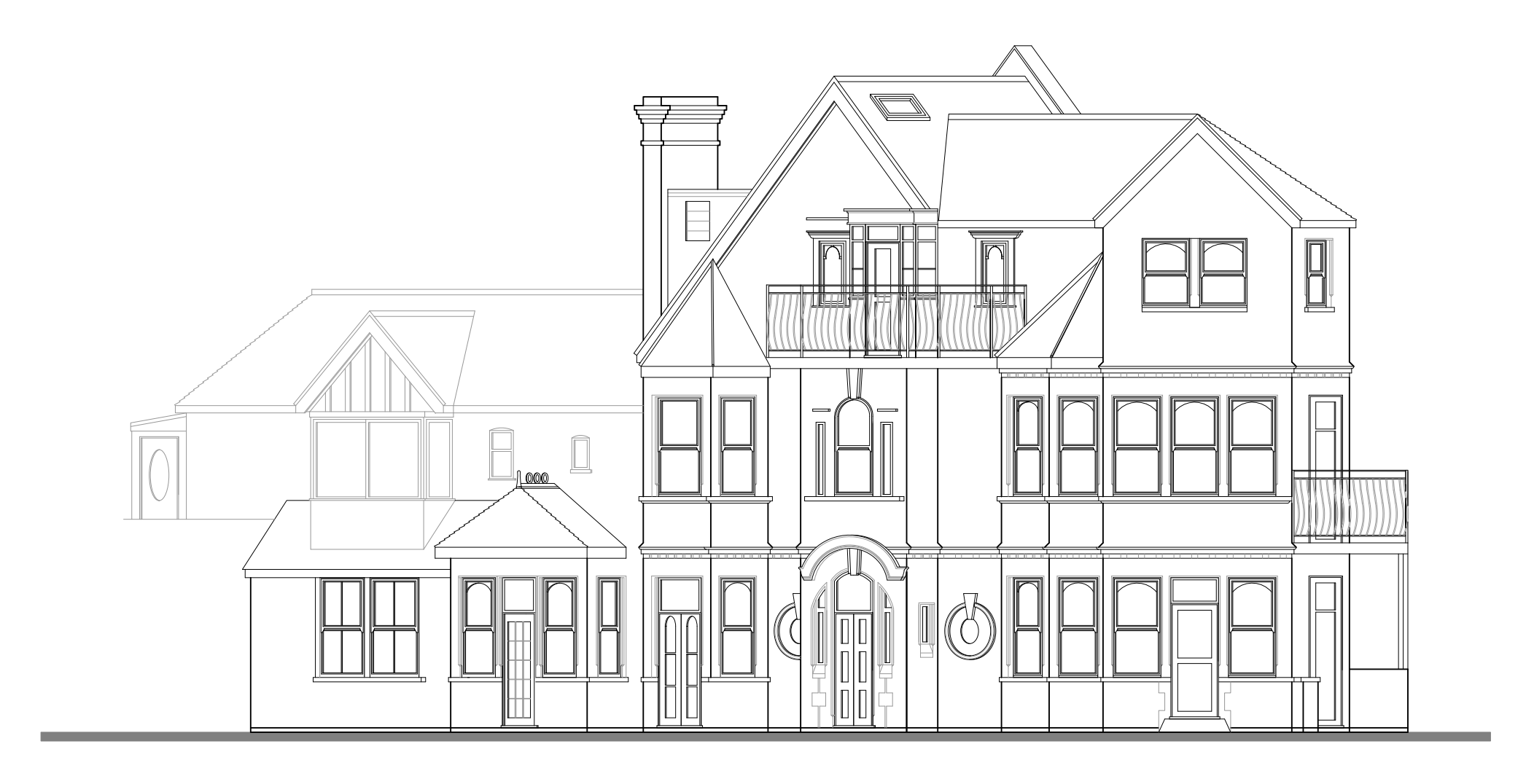
South West East